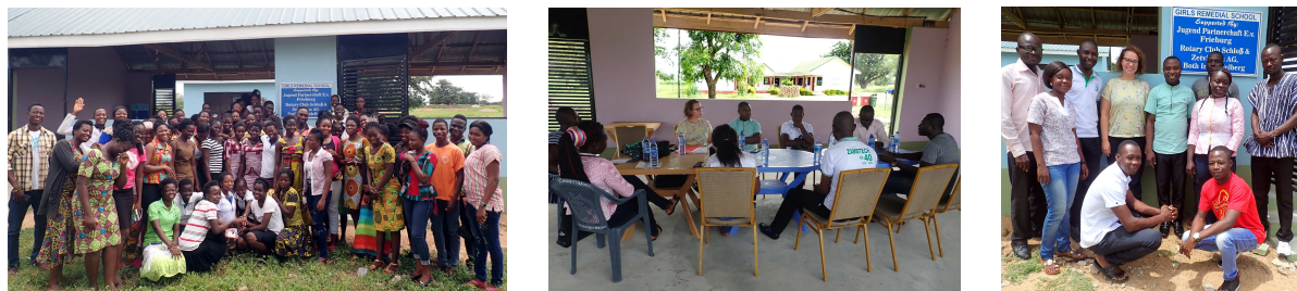
past and present RS students during the Homecoming event, discussions and group picture with the volunteer teachers