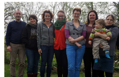
JPG Annual Meeting 2017