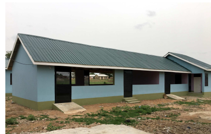
participants of the Remedial School 2017 at the accomodation of YHFG/ in class/ the new study shed