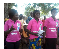
YC coordinator with youth ambassadors

The pilot phase was a big success and through the ambassadors many of the Remedial School 2015 participants were recruited. UNICEF and YHFG are currently repeating the program now known as Girls and Boys Against Child Marriage Campaign .