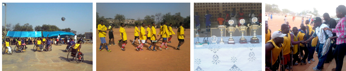
I can do anything sports tournament 2015

For the forth time, YHFG hosted the I can Do Anything Sports Tournament for students from the Harvest Academy and physically challenged youth. The tournament was sponsored by Kuntinkantan Foundation (the Netherlands) with a financial support, medals and trophies. Nine football and two basketball teams participated. The goal of this tournament is to provide opportunities for disabled youth to participate in sporting activities. It is designed to pioneer inclusion of physically challenged youth in sports and social activities in Bolgatanga.