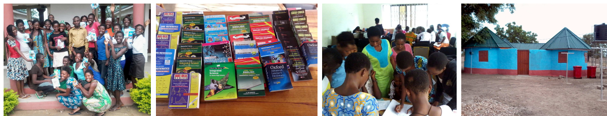
Enthusiastic students of the Remedial School 2015, new books and improved facilities

This year, the project was funded by ZetVisions AG, Heidelberg, Germany. Additional support was granted by the Help Ghana Foundation in the Netherlands. This allowed us to run the remedial classes and make several important improvements to the facilities, such as water installations for sanitation and kitchen, as well as mosquito protection in the dormitories. Books on Mathematics, English, Integrated Science, Social Studies, dictionaries and other books have been bought for the library to aid the students with their revision. New chairs with integrated desks were purchased to improve the learning conditions for the students.