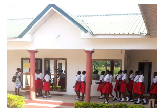
At the Youth Parliament 2015

Over the last few years, YHFG has been very successful in building cooperations with national and international partners, e.g. Christian AID (UK), RFSU (Sweden), UNICEF, Marie Stopes International, Ghana Education Services and Ghana Health Services. The joint activities of JPG and YHFG are mostly connected to the YHFG Youth Centre, which was commissioned in 2009 in a project funded by the Landesstiftung Baden Württemberg. In 2014, with funds from the German government, a new study and youth centre SKILL (Secure Knowledge Into Lifelong Learning) was constructed to establish a remedial school for senior high school students.