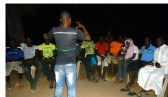
SPEEK out-of-school launch in March 2013 (l), SPEEK out-of-school groups (m,r).