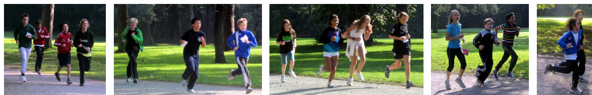
Students of the Otto-Pankok Schule raising funds for the partner school in Ghana in a charity run

To enable the existing classes to finally move into their school, only blackboards and doors are now needed. To complete this school, it is left with painting, outside plastering and furnishing of two classrooms.