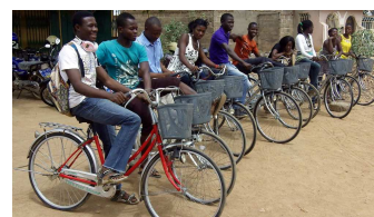
SPEEK Community entry, Discussing SPEEK with local clinics, Training of Peer Educators, PEs set off to their communities.